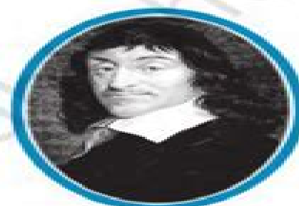
René Descartes (1596 -1650)

We also studied there following important formulae: