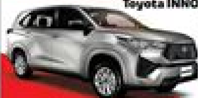
Toyota INNOVA 2.0L Petrol Auto 8 Seater