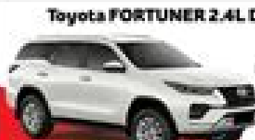
Toyota FORTUNER 2.4L Diesel Automatic 4x4 SUV