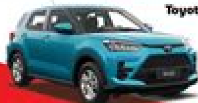
Toyota RAIZE 1.2L 5 Seater