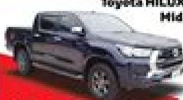
Toyota HILUX 2.4L Manual 4x4 Mid Spec Double Cab