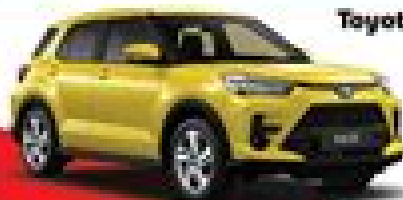
Toyota RAIZE 1.2L 5 Seater