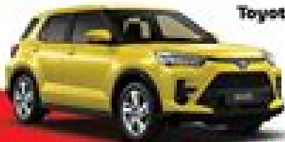
Toyota RAIZE 1.2L 5 Seater