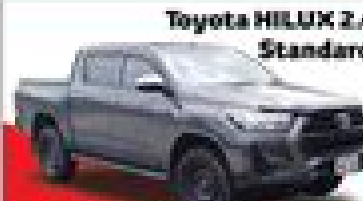
Toyota HILUX 2.4L Automatic 4x4 Standard Spec Double Cab