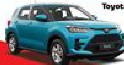
Toyota RAIZE 1.2L 5 Seater