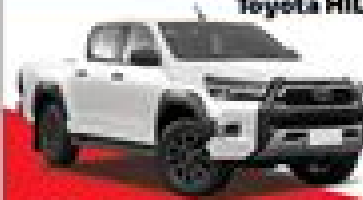
Toyota HILUX 2.8L Auto 4x4 Double Cab