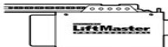
Model 1255R - 1/2HP Model 1245R - 1/3HP