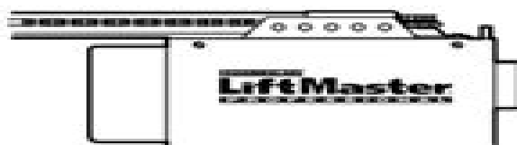
Model 1256R - 1/2HP Model 1246R - 1/3HP