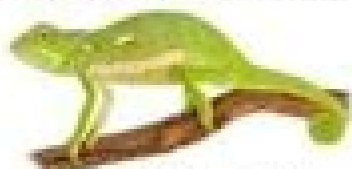
Flap Necked Chameleon