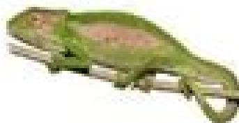
Cape Dwarf Chameleon