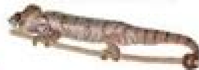
Malagasy Giant Chameleon