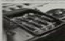
How this manual can help you understand, maintain, and repair your BMW 7 Series.