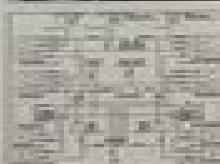
How this manual can help you understand, maintain, and repair your BMW 7 Series.