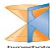
Figure 2 Types of Conic Sections

A focus is a point about which the conic section is constructed. It is a point about which rays from the curve converge.