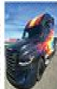
Michelin designed the tires for the future fleet's energy savings.

Michelin's "Energy Saver" tires are designed to help fleets reduce fuel consumption and improve efficiency. The tires are designed to help fleets reduce fuel consumption and improve efficiency. Michelin's "Energy Saver" tires are designed to help fleets reduce fuel consumption and improve efficiency. The tires are designed to help fleets reduce fuel consumption and improve efficiency.