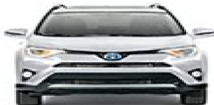
TOYOTA RAV4 HYBRID