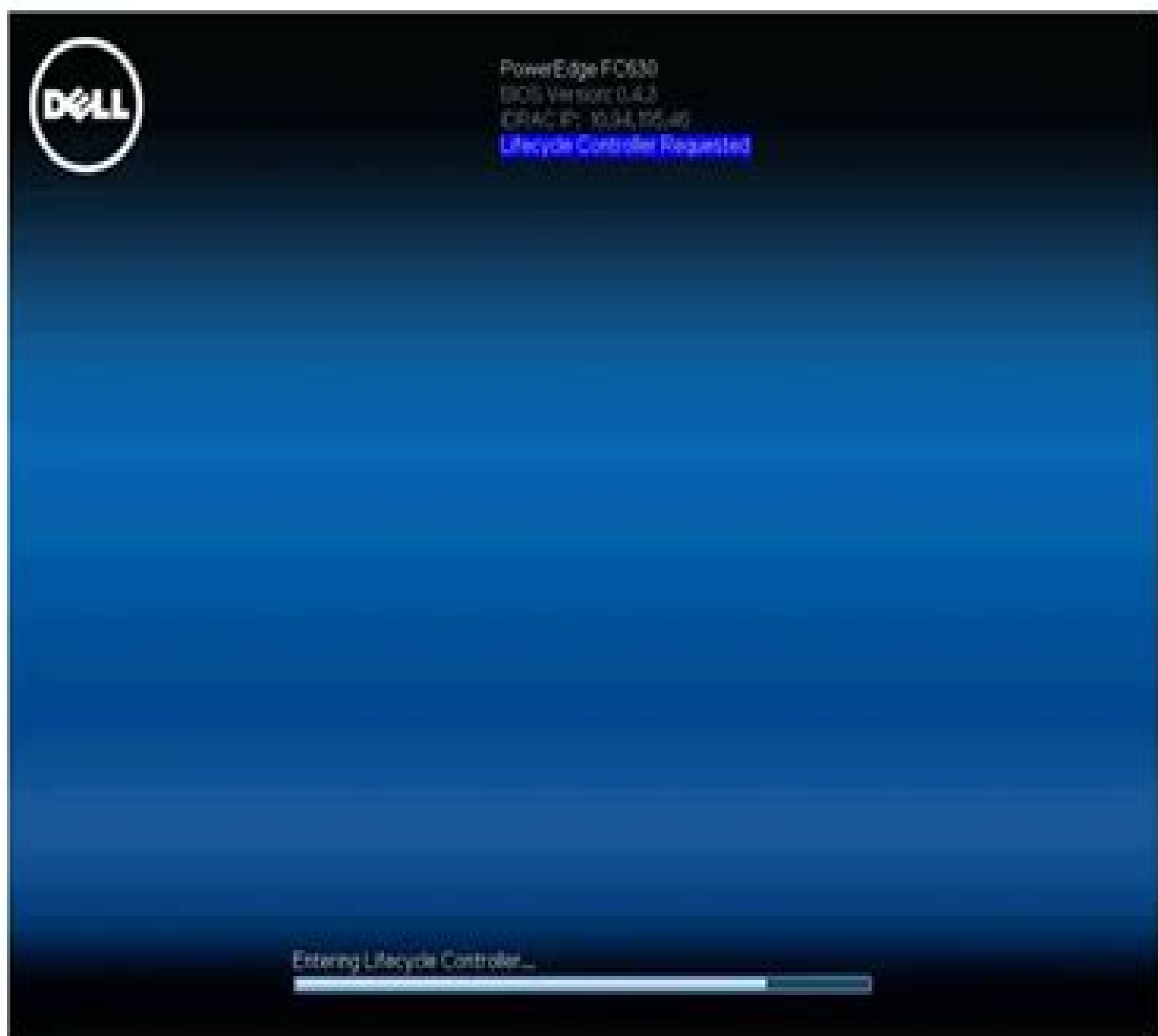
Figure 2. Starting Lifecycle Controller