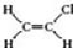
Chloroethene (vinyl chloride)