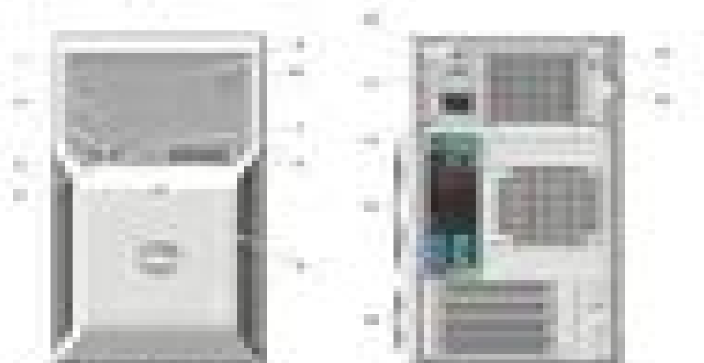
Back View of the Dell T1600