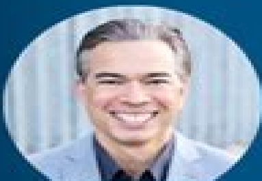
ROB BONTA, ATTORNEY GENERAL