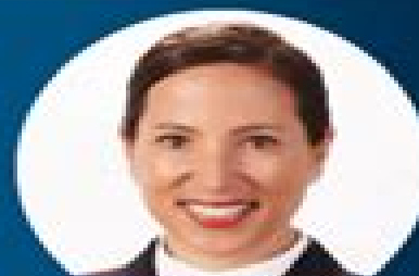
ELENI KOUNALAKIS, LIEUTENANT GOVERNOR