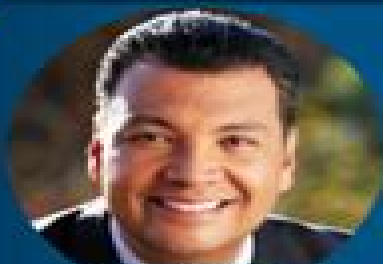
ALEX PADILLA, U.S. SENATOR