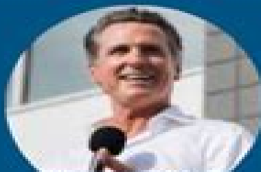
GAVIN NEWSOM, GOVERNOR