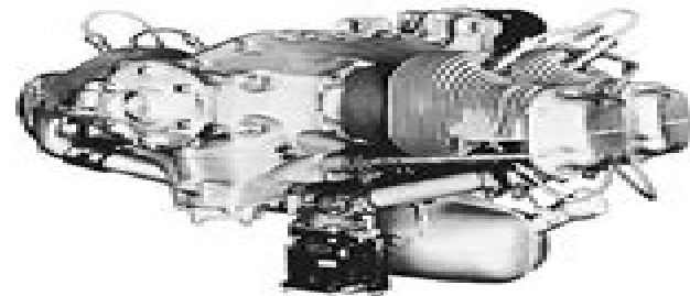
Figure 3. Three-Quarter Left Front View, Model C90-18P.

TM EDITION CONTINENTAL MOTOR Aircraft Products Division