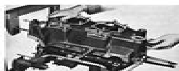
Figure 29. Installing Crankcase 1, 2 Side on 2, 4 Side.