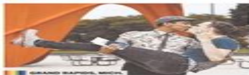
GRAND RAPIDS, MICH.