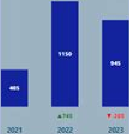
Crimes by Years