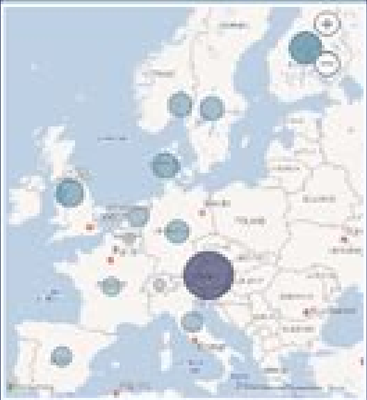
Crimes by Country