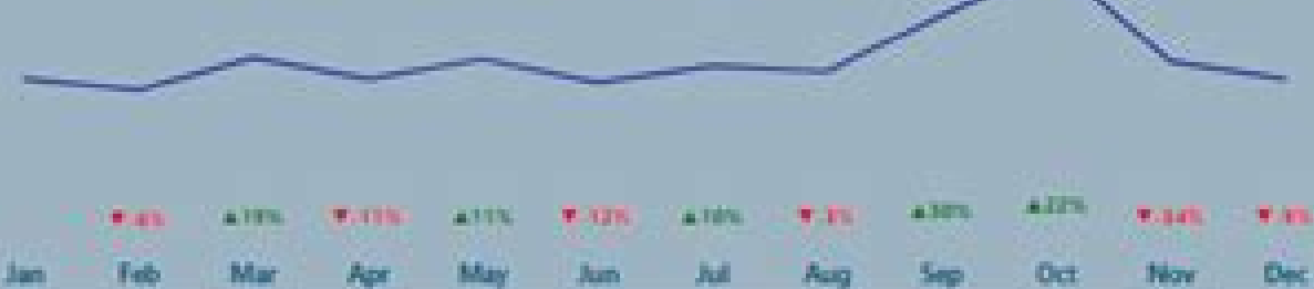
Crimes Monthly Trend