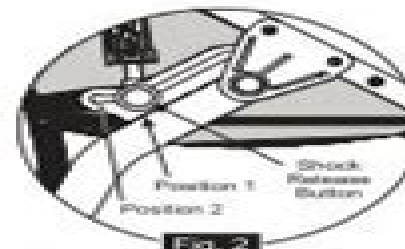
Fig. 2 Swingarm in unfolded position with shock in position 1.

4. REAR WHEEL: Place the rear wheel quick release lever in the open position, as shown in Fig. 4. Insert the rear wheel's stub axle into the hole in the