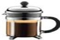
CHAMBORD Coffee maker 0.54/16.7oz 1934-35