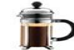
CHAMBORD Coffee maker 0.35/12.1oz 1923-16