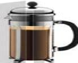
CHAMBORD Coffee maker 1.01/34.6oz 1928-16