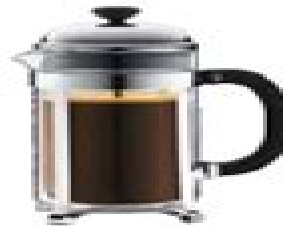
CHAMBORD Double wall coffee maker 2.01/54.6oz 20073-16