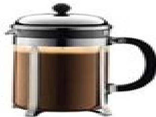
CHAMBORD Coffee maker 1.54/51.6oz 1932-35