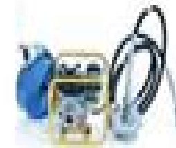
SUBMERSIBLE FLEXIBLE SHAFT PUMP