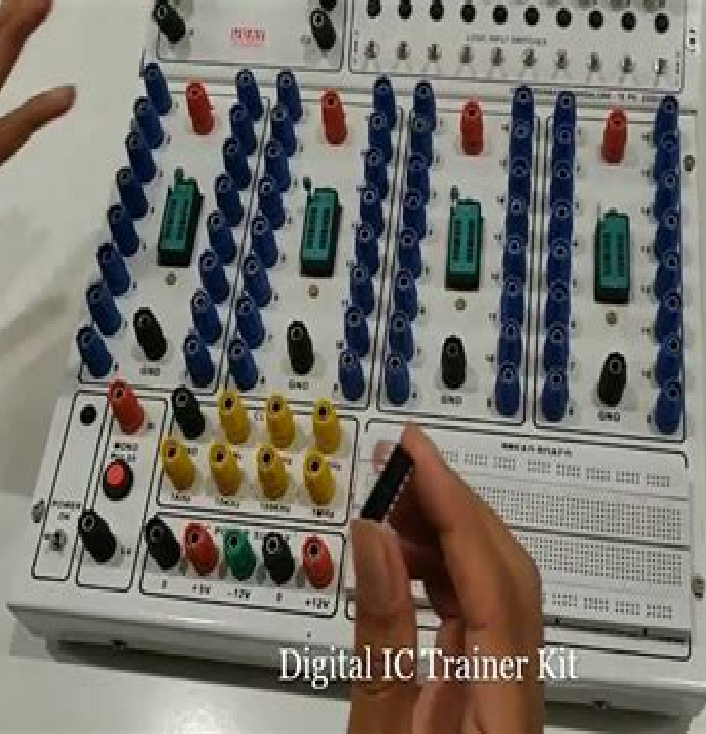
Digital IC Trainer Kit