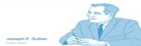
Joseph F. Sutter Designer of the 747 series.

The 747-400 is the most advanced aircraft in the world. It has the highest payload capacity, the most powerful engines, the most advanced avionics, and the most advanced cabin. It's the most advanced aircraft in the world.