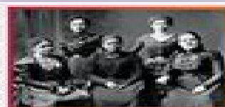
Women’s Club Movement