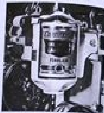
Figure 19 — Oil Filter

Engines oil does not "break up". However, the lubricating oil is contaminated by the by-products of the engine: dirt, water, condensed fuel, and other contaminants. The frequency of oil change is dependent on the conditions of the engine.