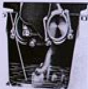
Figure 18 — Oil Pump

CAUTION: If the oil pressure is within or only below these limits, stop the engine (20-2500000000) and replace the oil filter. If the pressure is below these limits, stop the engine.