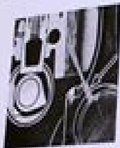
Figure 17 — Connecting Rod Spin Hole (See note on page 31)