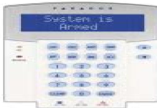
EVO641 / EVO641R DGP2-641BL / DGP2-641RB