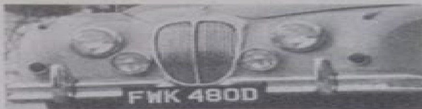
Daimler V8-250 (2,548 c.c.)

AT-A-GLANCE: Relatively small capacity road is surprisingly smooth. Available with either Bang-Wanner model 25 automatic transmission or 4-speed all-synchromesh manual gearbox. Quite good performance and better than average fuel consumption for its class. Fairly low suspension acceptable on normal surfaces. Very good all-disc braking system. Power assisted steering is an extra-cost option, as is an electrically heated rear window. Able to deal with wettest slush, heating and ventilation system falls short of modern standards.