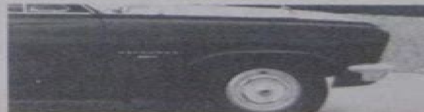
Vauxhall Viscount (3,294 c.c.)

AT-A-GLANCE: Most luxurious Vauxhall yet built. Power glide two-speed automatic transmission, power steering, electrically heated backlights, reclining seats, power windows and leather upholstery are amongst the standard features. A manual four-speed gearbox can be specified at reduced cost. Automatic transmission exceptionally smooth in operation, but additional work involved in the torque converter by having only two speeds has a detrimental effect on performance and economy. Very quiet and has quite good roadholding. Rather low geared steering is light, but retains adequate feel. Luxurious seven ride, but dislikes really rough surfaces. Very good brakes.