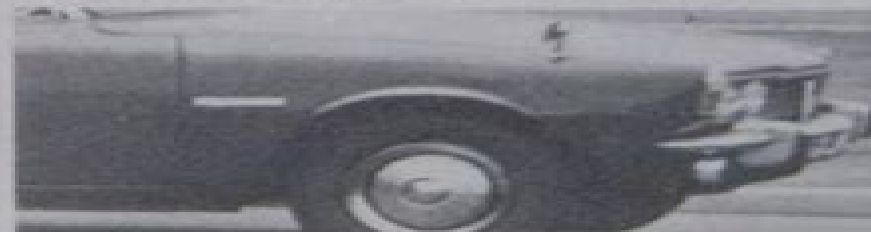
Rover 3500 (3,528 c.c.)

AT-A-GLANCE: Basically a Rover 3000 fitted with 3,528 c.c. aluminium road. Available only with Bang-Wanner Type 25 automatic transmission. Use of a large, big engine results in refined performance with reasonable economy. Automatic transmission smooth, but low upshift points. Very good handling despite considerable body roll. Superb brakes. Low speed steering effort rather high, but no major assistance option. Extremely comfortable individual seats and a highly efficient through-flow heating and ventilation system. Careful attention to safety.