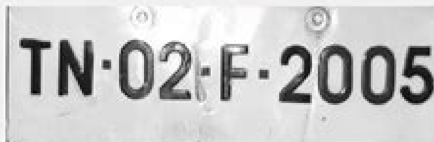
SEGMENTED LP IMAGE