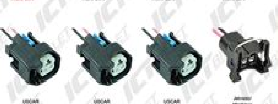
USCAR USCAR USCAR Mini-D (Optional) USCAR USCAR USCAR USCAR Mini-D (Optional)