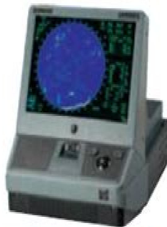
BridgeMaster E 180