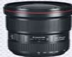
16-35mm f/4 L