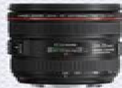
24-70mm f/4 L