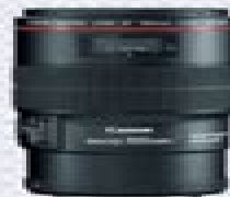
100mm f/2.8 L