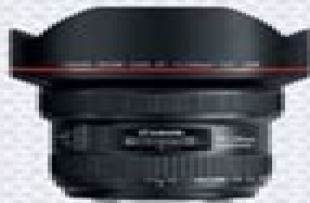
11-24mm f/4 L