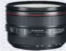
24-105mm f/4 L