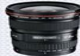
17-40mm f/4 L