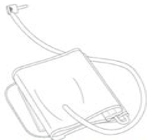
Arm Cuff With Tube