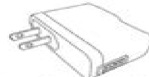
5V 1.2A AC/DC Adapter (Optional)