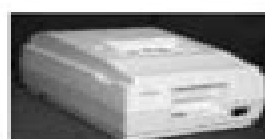
Epson Roll Printer: Item #5430-0058