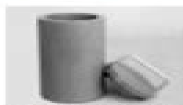
Auxiliary Shield Item #5420-2116