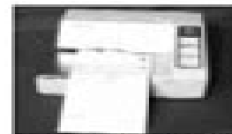
Epson Ticket Printer: Item #5430-0100