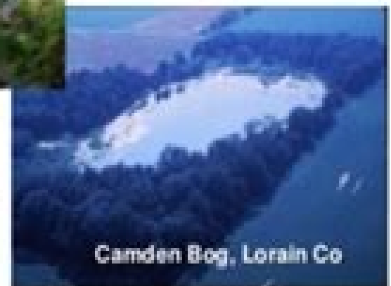
Camden Bog, Lorain Co