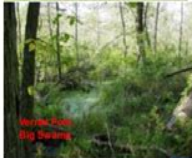
Vernal Pools, Big Swamp