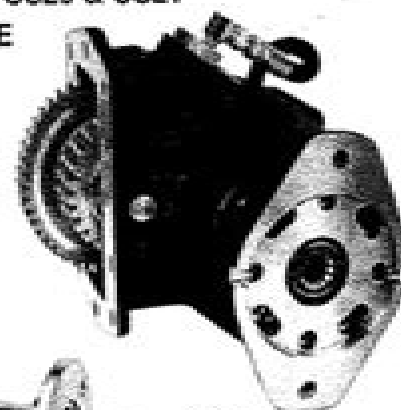
CS20 Series PTO

FOR CLUTCH SHIFT SERIES - CS10, CS11, CS20 & CS21 AND CONSTANT DRIVE SERIES - CD10