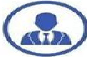
YOUR OWN BUSINESS