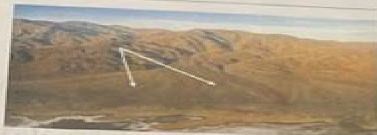
a. Figure 9.15 Photo to accompany Question 2.