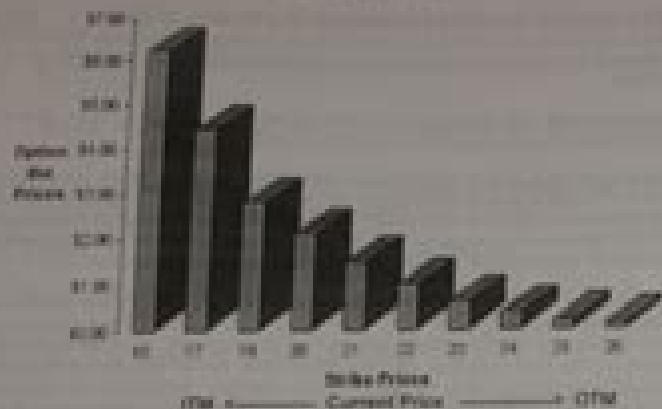
Figure 8: OTM Decay

The values of call options decline as the strike price gets Out of The Money. These, the actual dollar amounts, are all that leverage options traders really use. Speculators aim to buy OTM calls and see them double if the underlying advances by a few percent.