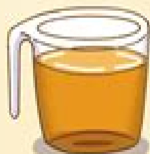
1 Cup Rendered Fat