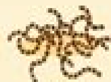
Insects (dried mealworms or crickets)