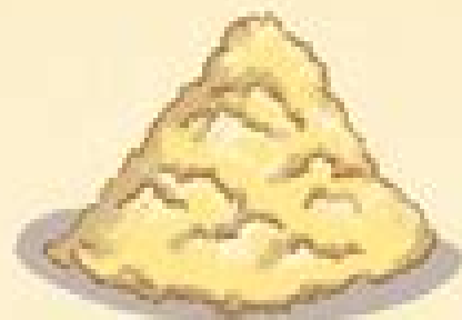
3 Cups Ground Cornmeal