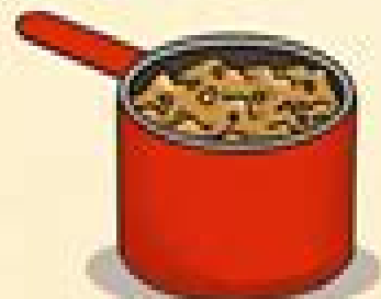
1 Cup Chunky Peanut Butter