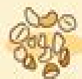
Chopped, unsalted nuts