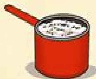
1/2 Cup White/wheat Flour