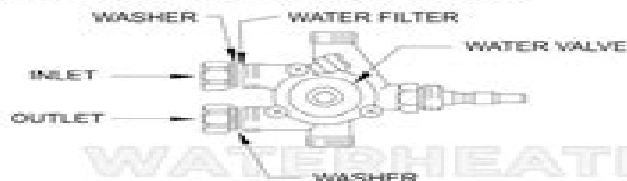
Fig. 5 - Water valve - top view

Although water piping throughout your structure may be other than copper, we recommend that copper piping be used for at least three feet before and after the heater (follow local codes if more stringent). Keep water inlet pipe to no less than 1/2 inch diameter to allow the full flow capacity. Remember that water pressure must be sufficient to activate the heater when drawing hot water from the top floor. If the hot and cold connections to the heater are reversed, the heater will not function. The AquaStar 125X is provided with two connectors that must be connected to the inlet and outlet fittings of the water valve as shown in Fig 5. These fittings seal to the water valve by means of a union connection with a washer type gasket at the joint. No pipe dope or thread tape is to be used at these joints. Be certain there are no loose particles or dirt in the piping. Blow out or flush the lines before connecting to the AquaStar. A ball valve should be installed on the cold water feed line to facilitate servicing the heater. For installation on a private well system, be sure that the water pressure is set between 30 and 50 psi.