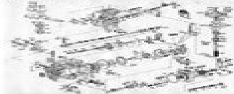
Bosch diesel fuel injection pump repair manual, 2009 yamaha grizzly 700 owners manual

Le logiciel devrait alors identifier et inscrire de lui-même la CPU connectée. Si la CPU n'est pas identifiée ou s'il apparaît un message signalant que la communication n'est pas possible, double-cliquez sur le champ Câble PPI.