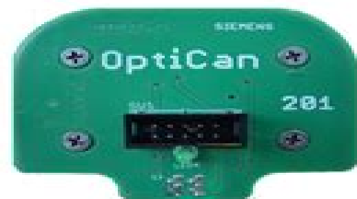
Tastkopf Siemens 201 needle Siemens 201