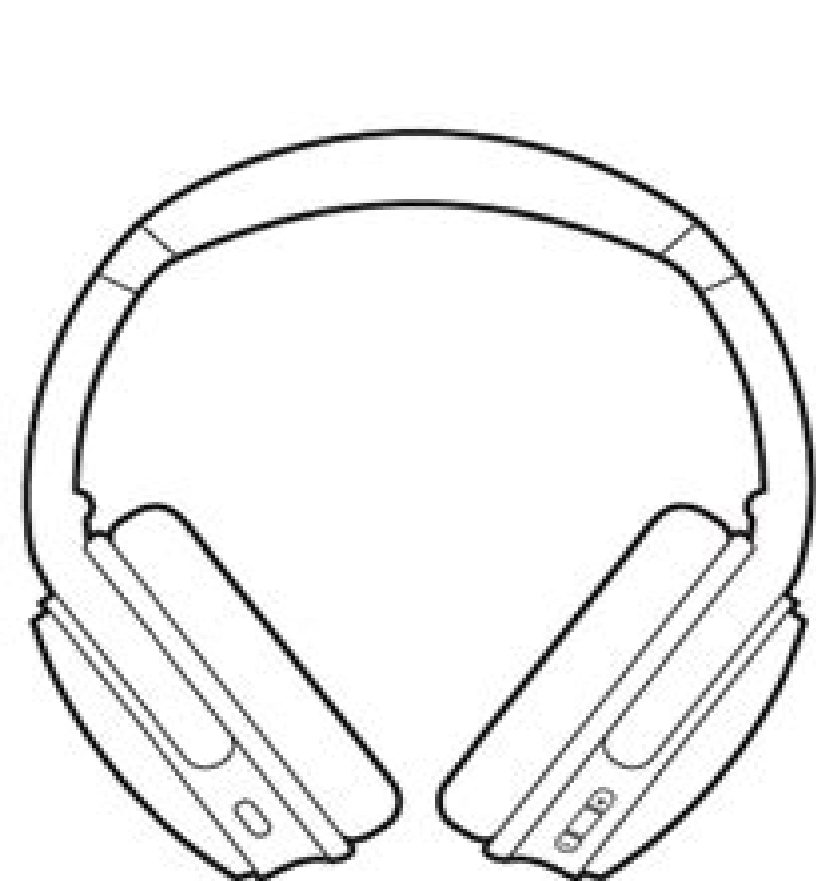
Bose QuietComfort Headphones