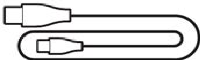
USB Type-A to USB Type-C® cable