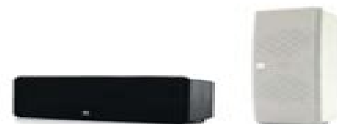
HS 225 minit and midrange

Horizon HS 40, 50, 60, 225 Bookshelf and LCR Speakers