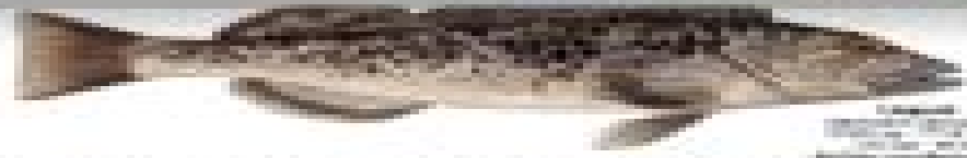
Black Rockfish Found in the Pacific Ocean along the California coast. It is a deep-sea fish that can live for over 100 years.

© 1998 by the California Department of Fish and Game. All rights reserved. Printed in the United States of America.