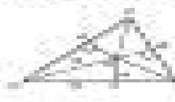
Diagram of a triangle with an altitude.