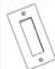
Cover plates Preserve the connections Place connections

© 2001 by John Wiley & Sons, Inc. © 2001 by John Wiley & Sons, Inc. © 2001 by John Wiley & Sons, Inc.