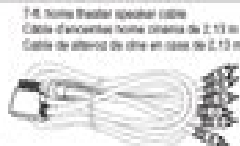
7-8. Name Weather speaker online Carte d'excursion Name online de 2 à 10 m Carte de l'excursion de la ville en ligne de 2 à 10 m