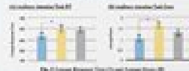
100% Guaranteed Refund Policy on all orders

Based on the existing literature, it is expected that unstructured environments reflect low control (i.e. being called) and thus increase attentional performance, while structured environments reflect higher control (i.e. being checked) and thus reduce attentional performance. It is expected that performance in the unstructured condition (signal) will be to improve the other two conditions.