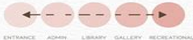
01 ARRANGING MASSES IN A TYPICAL LINEAR FORM