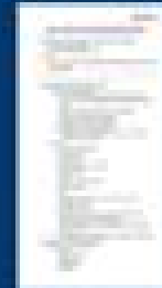
Policy Summary Sheets