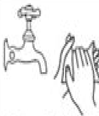
Turn tap off and dry hands.