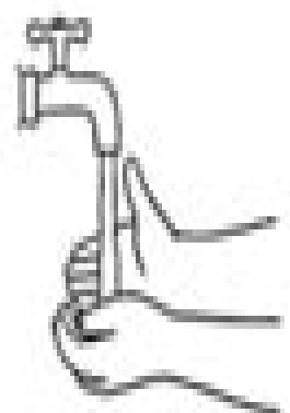
Wash soap off hands.