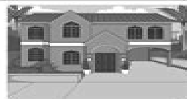
Home (as pet)