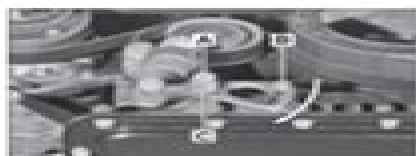
Adjust A/C belt tension. O2O Maintenance