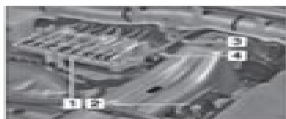
Locations of hundreds of electrical components: Fuse panel under passenger seat ECU, Electrical Component Locations